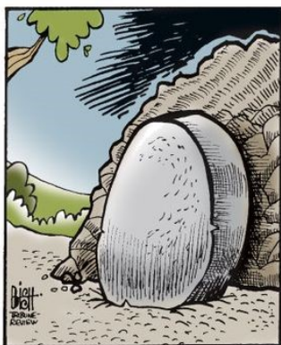
THE ORIGINAL ROCK