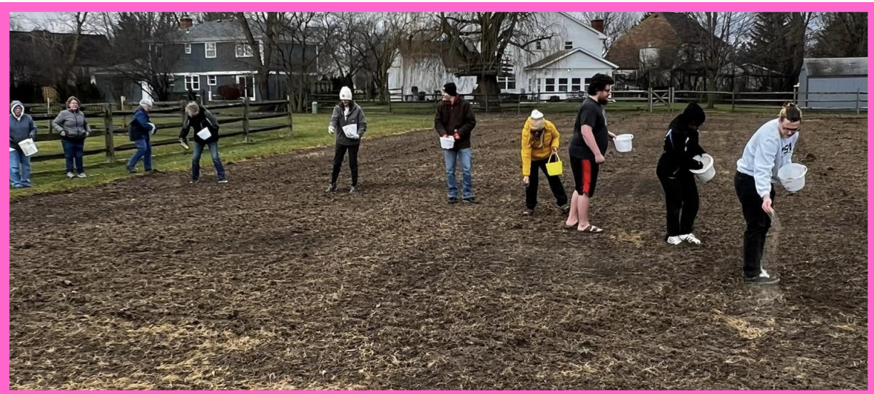
Planting Day December 30, 2023

On Saturday, December 30 th a group of about 25/30 people gathered for prayer and began to sow our pollinator seeds! Our seed mixture was purchased from the Ohio Prairie Nursey in Ada, Ohio— it is their pollinator mix and has 30 plants native to this part of Ohio that will grow in our sometimes wet clay soil. We added 3 different native grasses, which will add some winter interest. We were mildly surprised when all the seeds were dispersed in about 35 minutes! The rain and snow and freezing temperatures are helping provide the cold stratification that some of these seeds need to sprout in the spring! Once spring comes, we can expect to see some flowers and growth—but keep in mind that our native plants are using this first year of growth to work on their root structure. Some of these plants have roots that go 6 feet into the soil—which helps sustain them during drought and also helps to aerate the soil. We should start to see insects and some birds flitting around the plants this spring—but that activity will grow exponentially by the 3 rd or 4 th summer of growth! Sometime in the late summer, we plan to map out a walking path through the prairie and begin to mow that path, adding a bench or two, for people to meditate on the beauty of creation and to offer up prayers. For photos of the day, take a look at our Facebook page and the 3 ring binder in the narthex. The binder also includes the full list of plants included in our seed mixture.